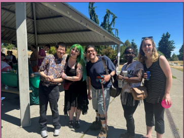
Thank you City of Shoreline for awarding us a $1,000 Love Your Community grant, helping us acquire everything we needed for our annual community picnic.

Please mark your calendars for our upcoming annual golf tournament, set to take place on September 17, 2025 , at the Golf Club at Newcastle.