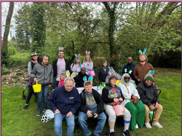
Thank you to the Shoreline Rotary Club for their collective contribution of $208 towards our Easter Egg Hunt!